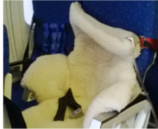
RBF Bunett Body Support